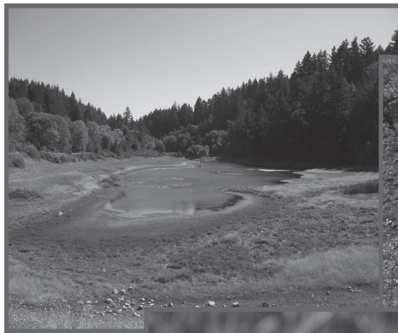
Sanborn County Park