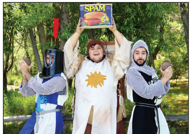
Members of the Spamalot ensemble pose with one part of their namesake.