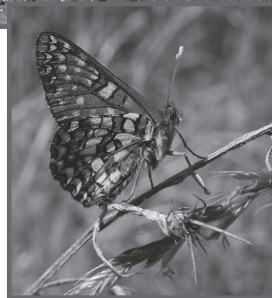
Chalcedon Checkerspot, Almaden Quicksilver County Park